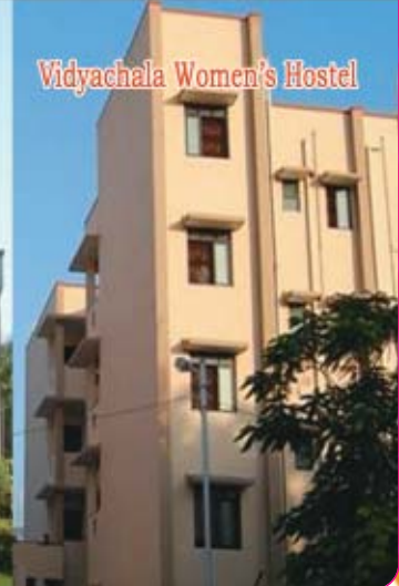
Vidyachala Women's Hostel